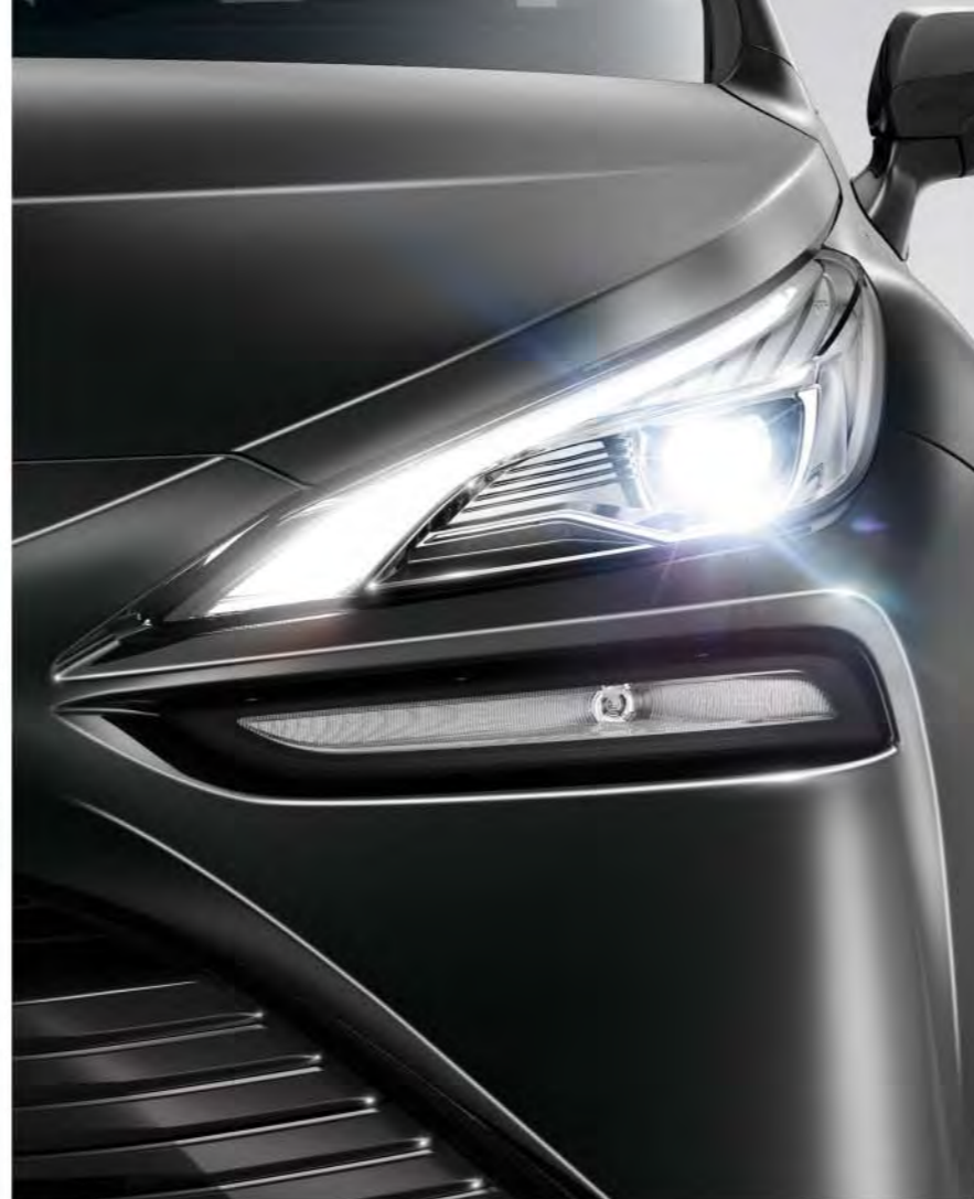
Stylish Bi-LED headlamps including Automatic High Beam light the way safely.